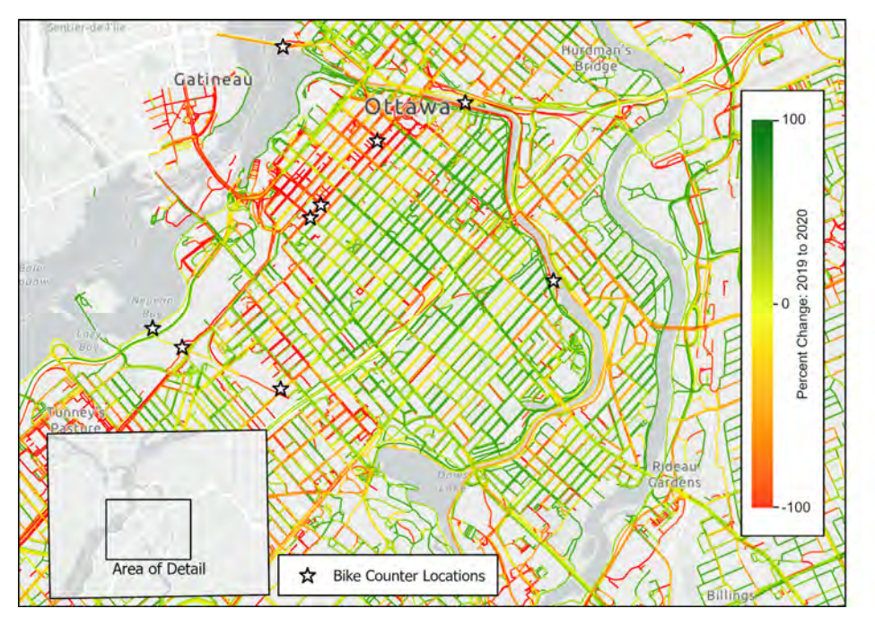
Change in bicycle trips between 2019 and 2020 (data provided by Strava)

On the map below, we can deduce that City of Ottawa bike counters were set up in locations to capture the bulk of traditional cycling traffic, either along major commuting routes or along NCC pathways. With residents making the shift to using their bicycles on many of Ottawa's streets for everyday transportation, should this change how we collect cycling data and how we build bicycle infrastructure to provide safer streets for all ages and abilities?