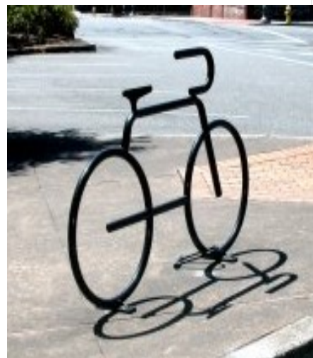
Bike racks need not be boring, nor ugly.