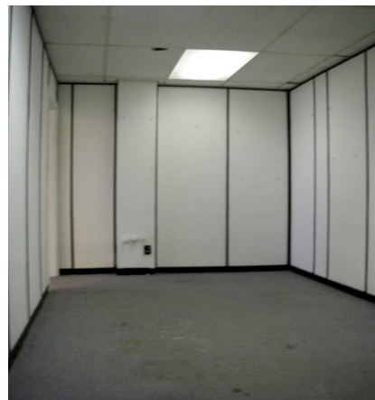
...And the impressive results.