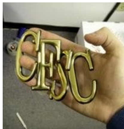
With the office closed, CfSC's future is in the hands of volunteers.