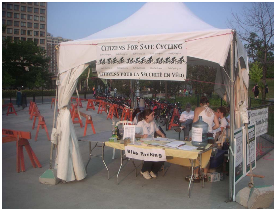
Our dedicated volunteers staffing valet parking during BluesFest.

Contact CfSC's Membership Administrator at Membership@SafeCycling.ca . 🚲