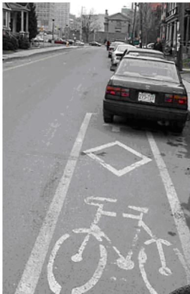
The draft City of Ottawa Cycling Plan proposes spending $1 Million to paint bike lanes on quiet residential streets.

Cyclists have told us they don't want bike lanes like this one, that make cycling more dangerous and confusing instead of safer and more enjoyable.